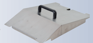
GABLED LID FOR PWB-8