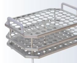
TEST TUBE RACK FOR PWB-8