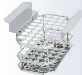
TEST TUBE RACK FOR PWB-4