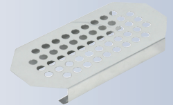
FLASK TRAY FOR PWB-4