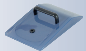
GABLED PLASTIC LID FOR PWB-4