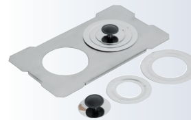
FLAT LID FOR PWB-4