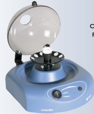
COMBISPIN FVL-2400N PLUS

Rotation speed (constant): 2800 rpm (50 Hz), 3500 rpm (60 Hz) Max RCF: 450 x g (50 Hz), 700 x g (60 Hz) Continuous operation time: < 60 min Accessories included: 1 rotor for 12 x 1,5 ml 1 rotor for 12 x 0,5 and 0,2 ml Overall size: 190 x 235 x 125 mm Weight: 1,7 kg