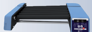
TR-6 WITH PLASTIC BODY AVAILABLE IN APPROX 2019